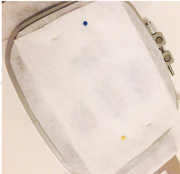
Back Side of Hoop

Add second square of felt to the back of the hoop with pins or double sided tape.